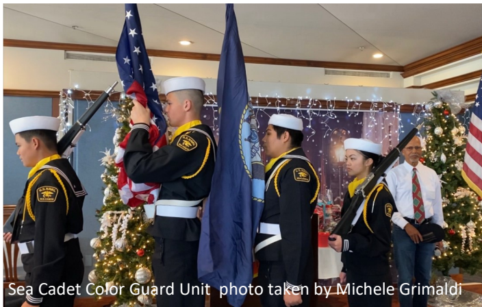
Sea Cadet Color Guard Unit