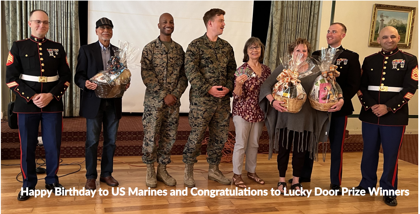
Happy Birthday to US Marines and Congratulations to Lucky Door Prize Winners

WINTER 2024 JAN. FEB. MAR.. Vol. 47 Issue 1