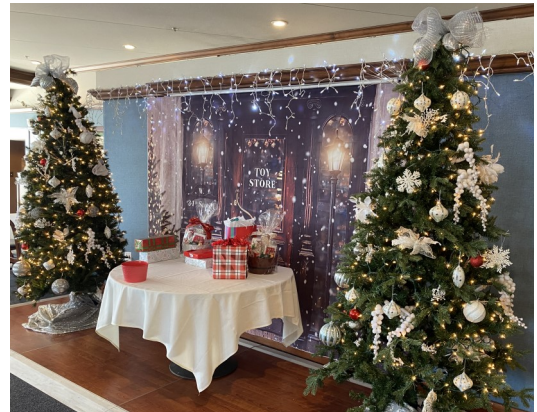
December 10, 2023 at Pacific Corinthian Yacht Club