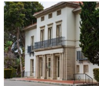
Thomas R. Bard Mansion