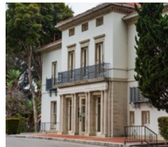
Thomas R. Bard Mansion