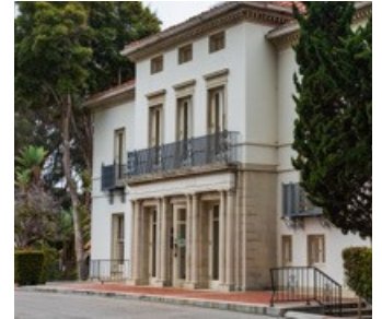
Thomas R. Bard Mansion