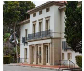
Thomas R. Bard Mansion