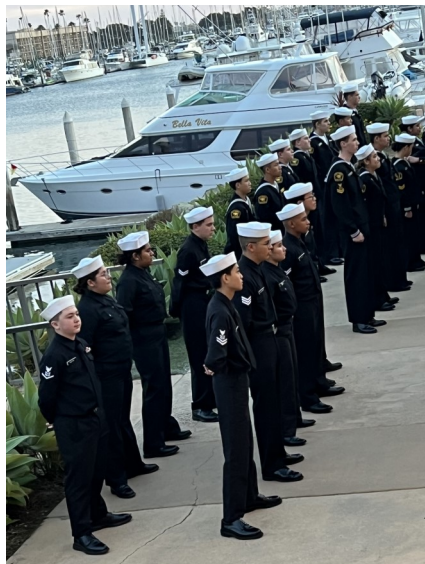
Training Ship Nicholas H. Anderson, NLCC