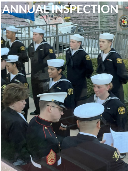
Ben Moreell Battalion Unit, NSCC