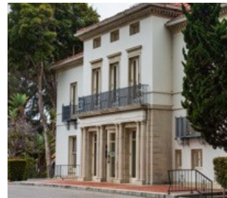
Thomas R. Bard Mansion