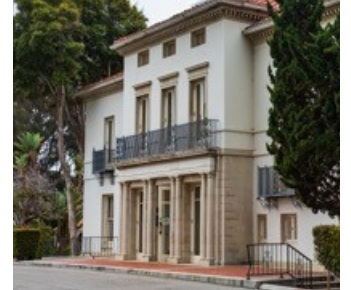
Thomas R. Bard Mansion